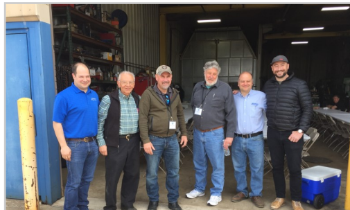
Great Connections (Spring 2017)