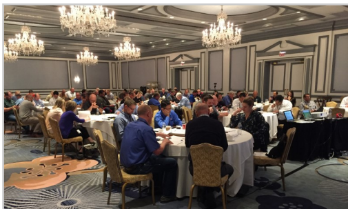
Great Information (Spring 2017)

DRESS: ITPA fall events are business casual. Dinners are semi-formal.