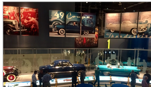
Great Networking (Spring 2017)

2017 Fall Meeting, Hotel del Coronado, San Diego, CA, October 19-21, 2017